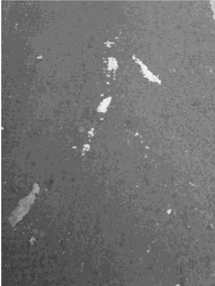
Shadow of his former self